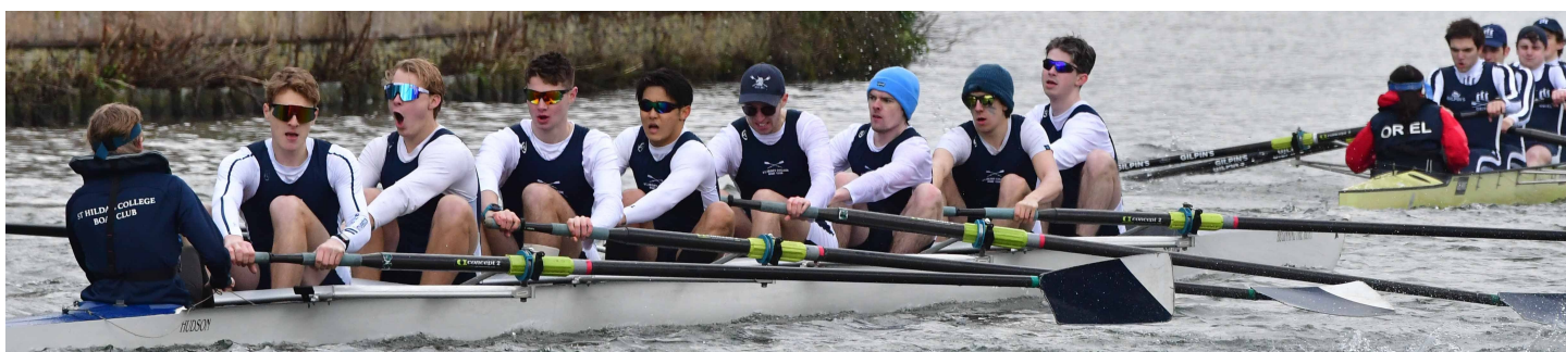
Moments before M1 bump as sandwich boat, securing their place back in Division III.