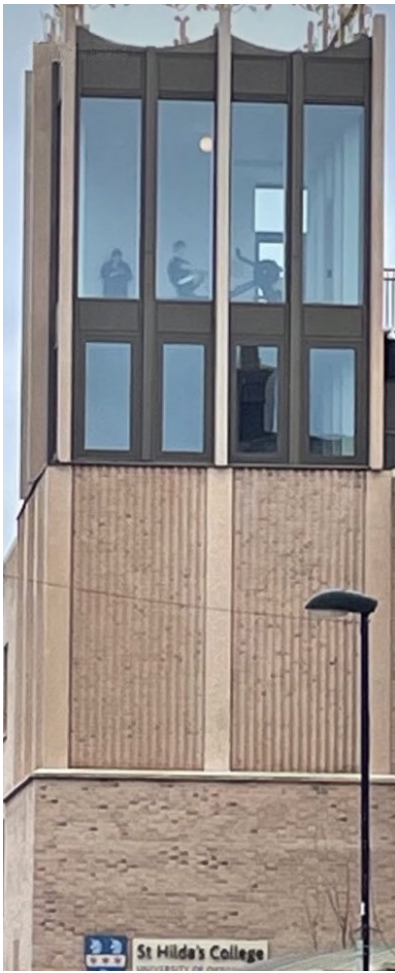
The 24-hour ergathon in progress. Over the course of the day the boat club rowed a total of 579km and raised £2512.