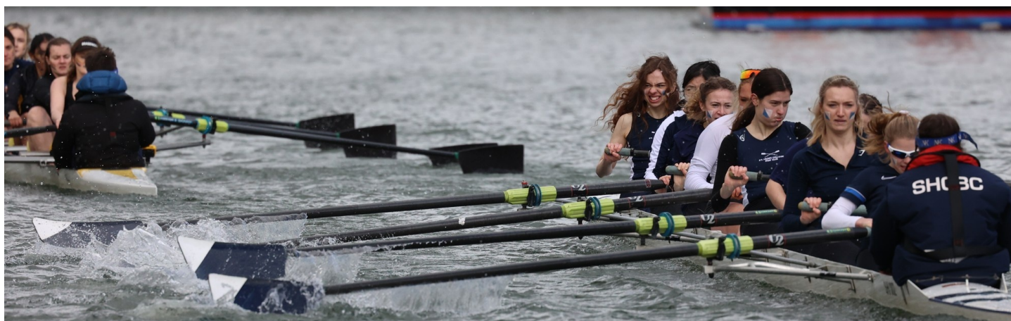
Above W2 ferociously closing down on their final bump for blades.

Following are some of the defining moment of our 2023 Torpids campaign!