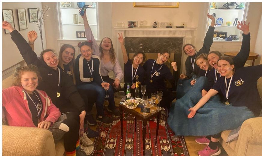
Novice women celebrate their Nephthys win at the Principal's house with the club's President, their Captain, and Vice-Captain; third, fourth, fifth from left respectively

With a week to go until Michaelmas Novice Regatta (formerly Christ Church Regatta), the women knuckled