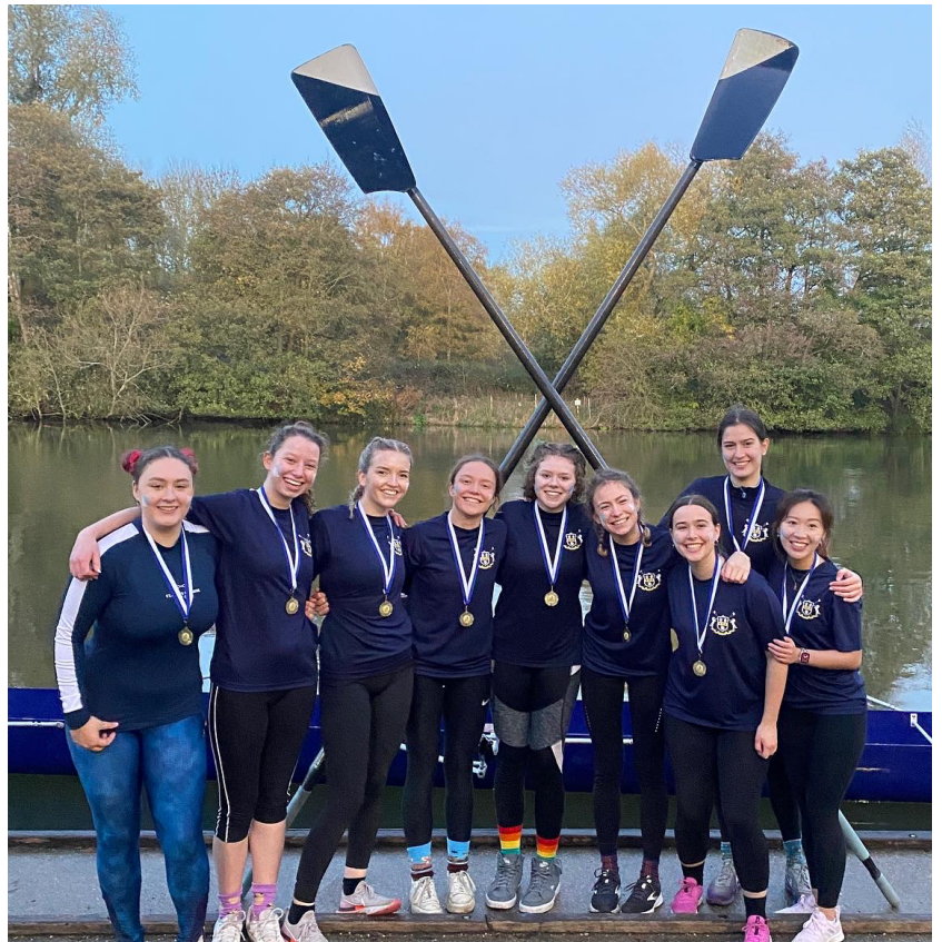
SHCBC novice women pose with their gold medals following their Nephthys win

Following their victory, the women were invited to celebrate with the Principal. (Pictured on page 2)