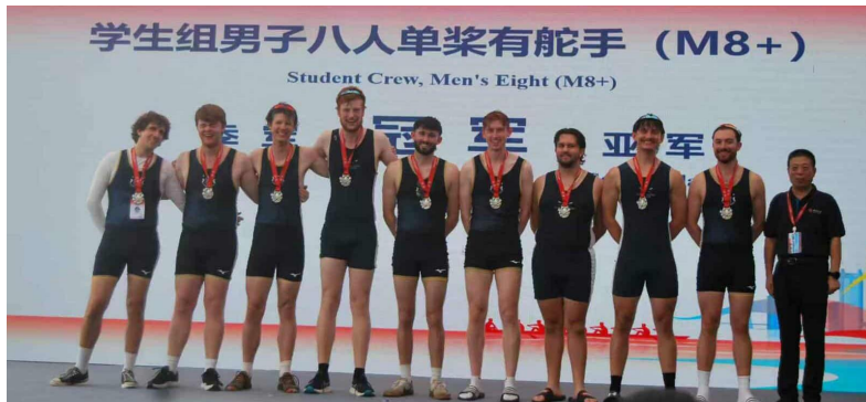
Above, SHCBC members racing in the Shenzhen Regatta